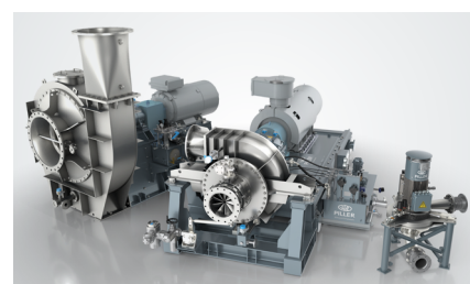
PILLER VapoLine – Blowers and Compressors specially engineered for vapor compression

With the VapoLine product portfolio, PILLER provides the perfect range of options to save energy and reduce carbon emission, demonstrating its competence as an expert in vapor compression technology.