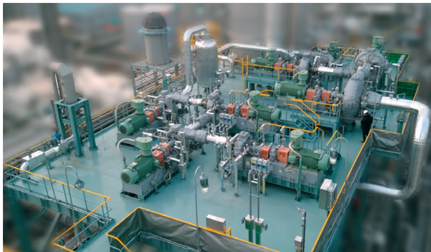
Mechanical steam compression system for a high temperature Heat Pump

Instead of transferring the heat released by condensation into the environment through cooling towers, it is reused to produce low pressure steam in an evaporator. With a multi-stage mechanical vapor recompression (MVR) system, the steam is compressed back to the pressure level that supplies the stripping unit.