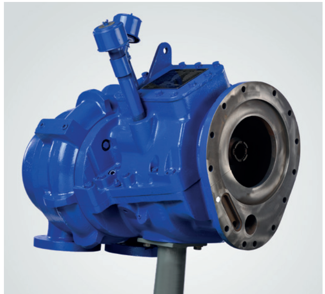
The PILLER A-Series compressor: It's high quality, durable and affordable. PILLER can meet the shortest delivery time.

We are equipped for your emergency and have all of the most common A-Series compressors in stock. We can guarantee a short delivery time of less than a week for most atomizing air compressors models. It's also possible to reduce the downtime even more with the assistance of the PILLER service team. Our experts support your technicians with the installation of the A-Series compressor. We will reply to all technical questions on the phone by request or travel to your installation, so that your GE Frame Gas Turbine will be operational again in no time.