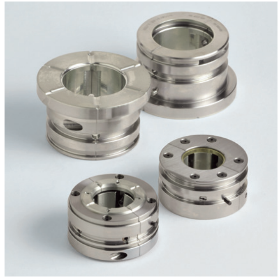
High speed and low speed bearings.