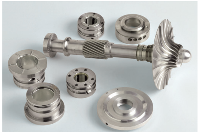
Replacement parts, which also fit the Atlas Copco SCF-6.