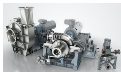
PILLER VapoLine – Blowers and Compressors specially engineered for Vapor Recompression

With the VapoLine product portfolio, PILLER provides the perfect range of options to save energy and reduce carbon emission, demonstrating its competence as an expert in Vapor Compression Heat Pump solution.