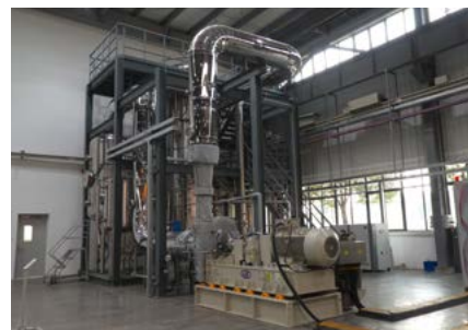
PILLER's falling-film evaporator in our own MVR plant

All developments are tested in our own MVR plant. It is used for quality assurance, endurance tests, and working product demonstrations.